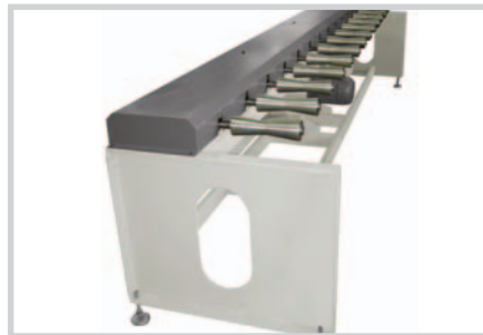
Linear Transfer with V Rollers