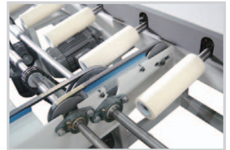
Drop Down Rollers and Take Away Belt