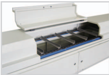
Linear Cross Bar Conveyor with Hood