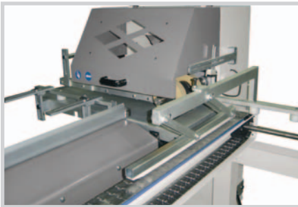
In-Feed Transfer with Metal Track